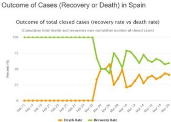
Figure 2 - Outcome of Cases (Recovery or Death) in Spain

Again, however, this indicator is not without certain disadvantages as an indicator of mortality at initial stages of the epidemic. The main one is that rate of the deaths number at the first stages exceeds the rate of the recovered number. That is to say, the characteristic time of transition from the state of the cases identified to the state of recovered and deceased is different. Therefore, when comparing on a daily basis the recovered and the dead, essentially different entities are compared. As a result, the mortality rate I(CC) at the initial stages of the epidemic is often higher than at the final stages.